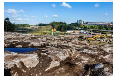
Project Hjulsta Södra